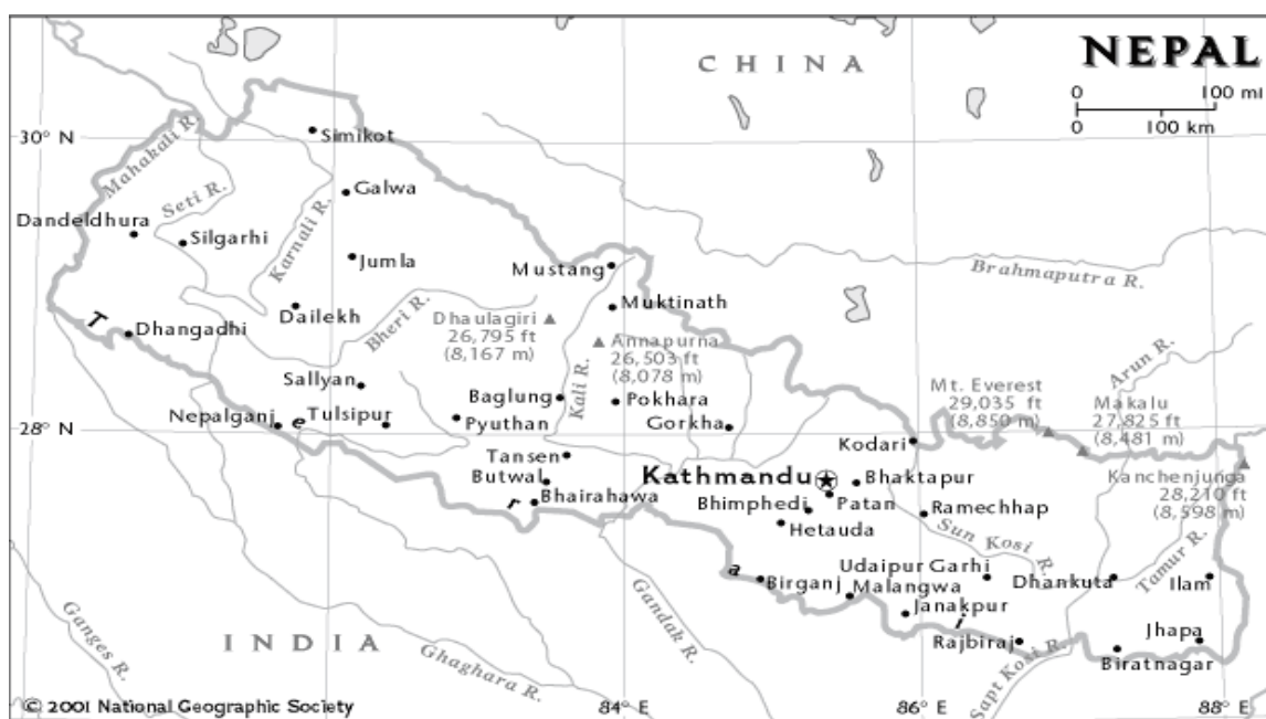
Map of Nepal

To examine the human security challenges to disarmament, demobilization, and reintegration (DDR) through a gender-sensitive lens