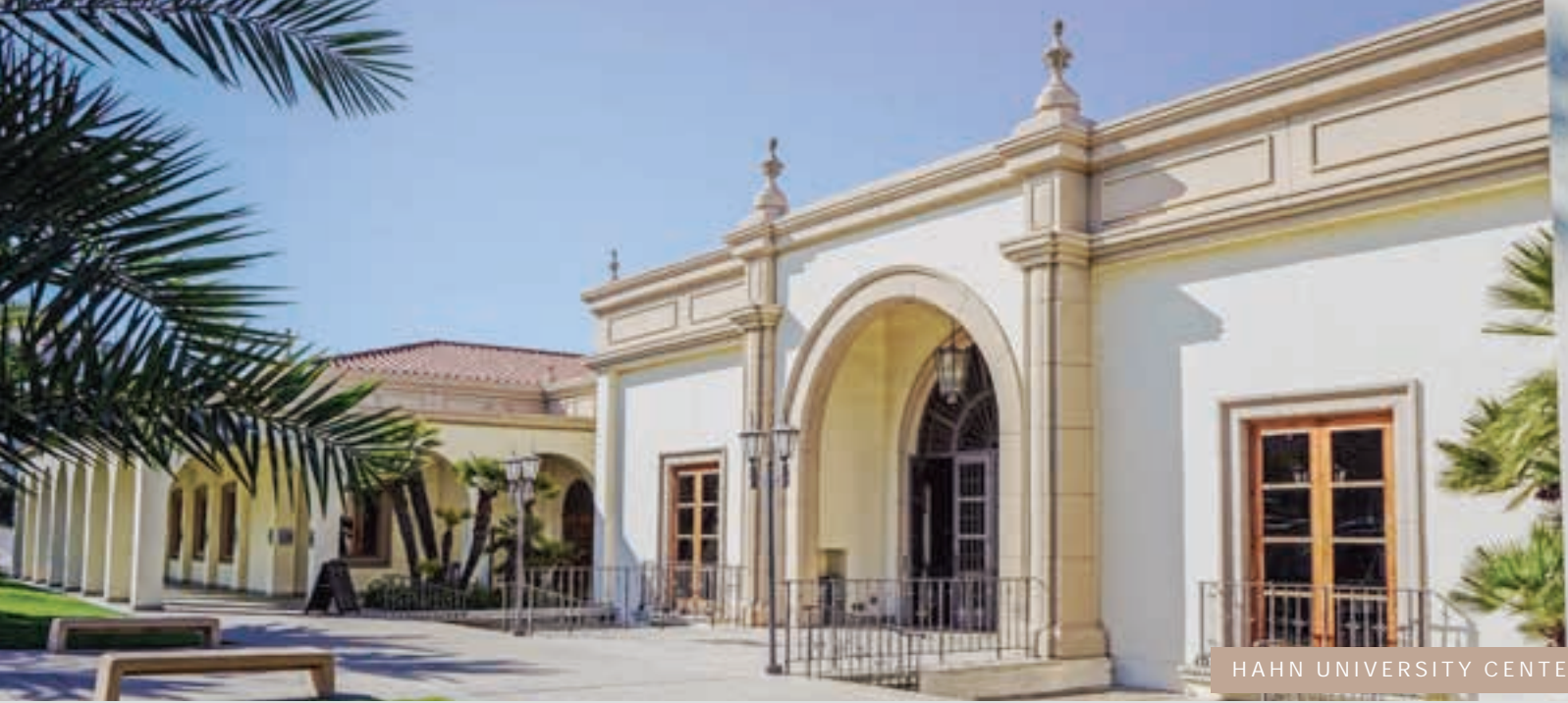
HAHN UNIVERSITY CENTER