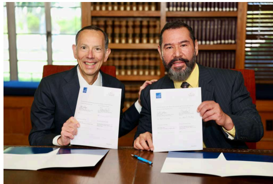
USD School of Law Partners with CETYS University to Expand Access to U.S. Legal Education