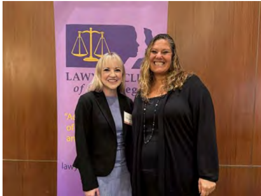
USD Law Women's Clinic Receives Fund For Justice Grant from Lawyers Club of San Diego