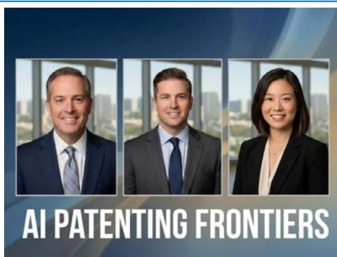
USD Law Hosts Expert Panel on the Frontiers of AI Patenting