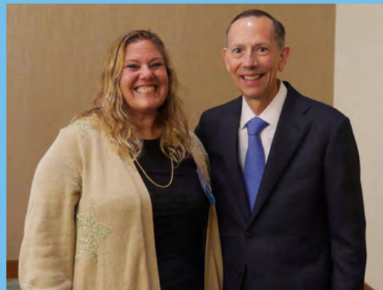
Women's Clinic Receives Lawyers Club Grant