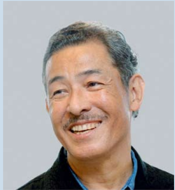
Issey Miyake 2007 Arts and Philosophy Kyoto Laureate

Visit www.sandiego.edu/kyoto . Call (619) 260-4231.