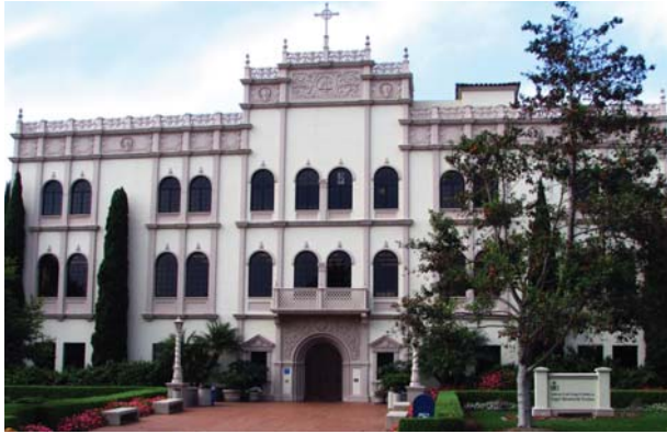
Pardee Legal Research Center at the University of San Diego School of Law