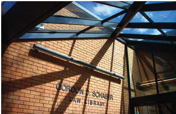
Gordon D. Schaber Law Library at Pacific McGeorge School of Law