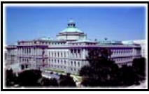
Thomas Jefferson Building of the Library of Congress

Search results are sorted in relevance order, with the bills from different congresses intermixed. Different versions of the same bill are scattered in the results. Because different versions can have slightly or dramatically different text, they can show up anywhere in the relevance-ordered results. When the user selects one bill to display, an "Other Versions" link will appear at the top of the screen if other versions exist. Users should check the other versions to be sure they have the most recent or most relevant text for their needs. Searchers using the full text search, whether for a single congress or for several, should do a little further research in the Bill Summary and Status file, Congressional Record , and other sources to confirm that they have the right bill[s] and the right version[s].