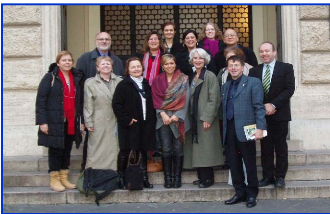
USD faculty outside the Jesuit Gregorian University

Over the course of this program, this group of individuals from diverse backgrounds, disciplines and contexts, blended to form a strong and mutually enriching community – bonded by debate, shared meals, conversation, humor and their commonality in being part of the USD family and community itself. Look for details soon in relation to presentations that participants will be giving in relation to their own experiences.