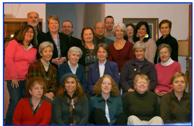
and with RSCJ General Council members.