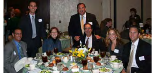
April 8 USD Scholarship Luncheon