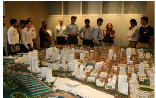
MSRE students take part in a field trip during Process Week