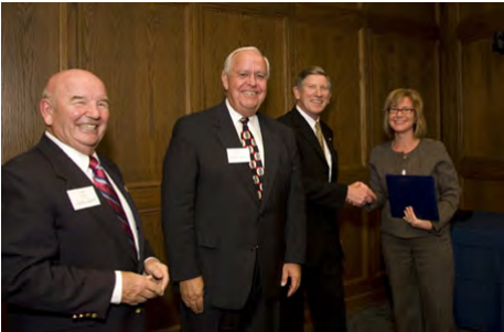
Nov. 12 graduation ceremony for the Real Estate Certificate Program