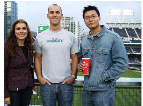
Real Estate Society's end of the academic year celebration at Petco Park