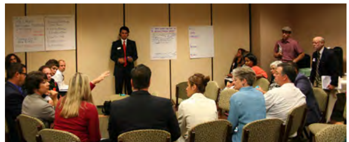
REO Symposium participants discuss San Diego's foreclosure crisis