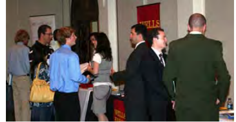
Sixth Annual Real Estate Career Expo