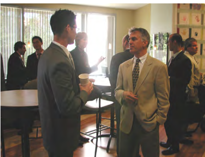
Cushman & Wakefield networking event April 18