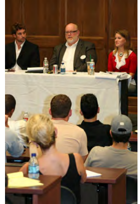
Sept. 25 First-Time Homebuyers' Seminar