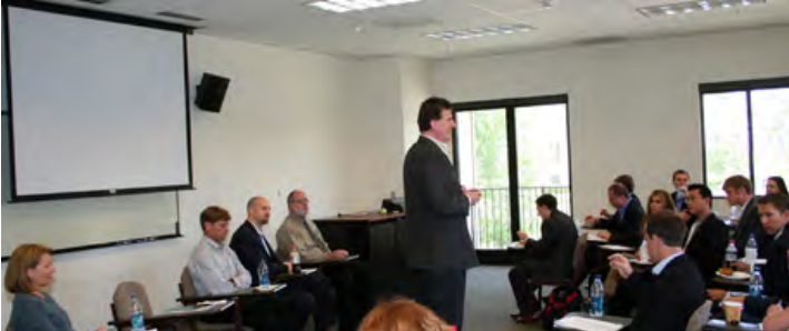
MSRE presentations of La Jolla Commons development in UTC