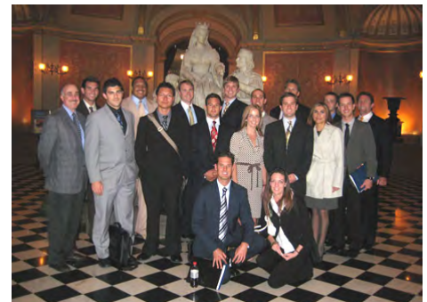
CBIA Homebuilding Day in Sacramento