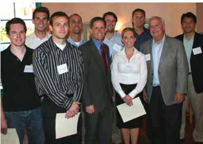
Class of 2008 Alpha Sigma Gamma members