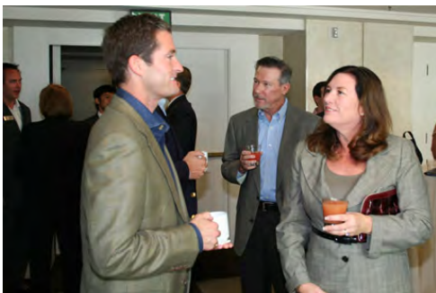
California Bank & Trust networking event