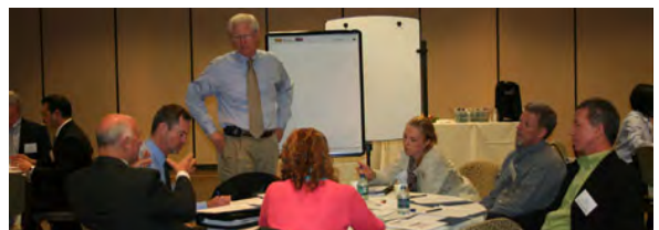
Jan. 29 Chula Vista Research project workshop