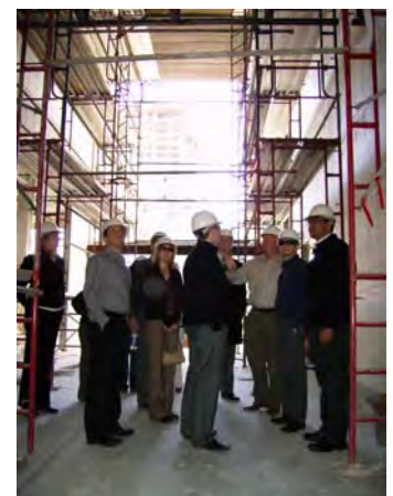
The Real Estate Society at the DiamondView Tower tour