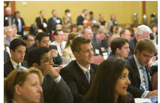
MSRE students at Homebuilders Day in Sacramento