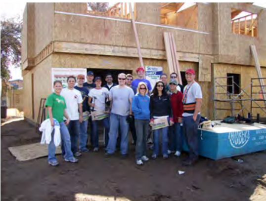
The Real Estate Society at the Habitat for Humanity build