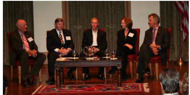
"Retooling Your Real Estate Career" panel discussion