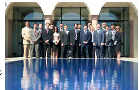
2007 MSRE graduates