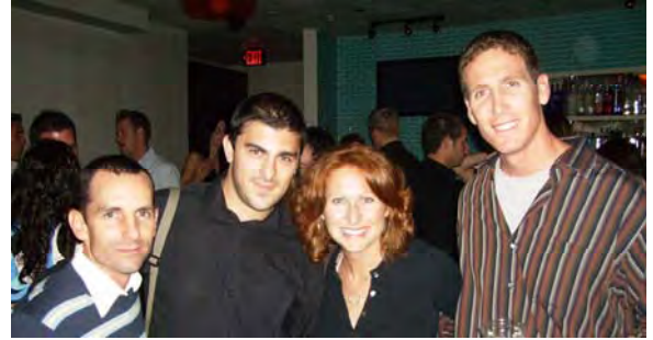
Real Estate Alumni Association Homecoming at Stingaree