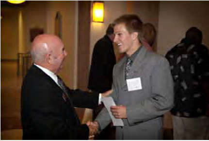
Breakfast at the BMC

in American Education” and the 36th edition of “Who’s Who in Finance and Business.”