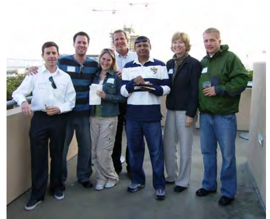
MSRE students and Center faculty and staff at Petco Park