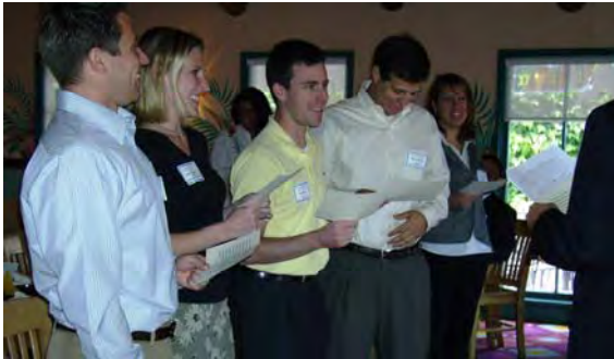
Alpha Sigma Gamma induction