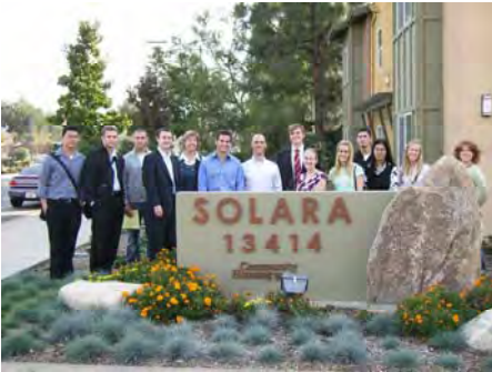
Solara Tour in Poway, Calif.