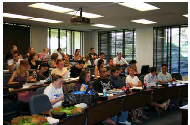
Real Estate Society meeting