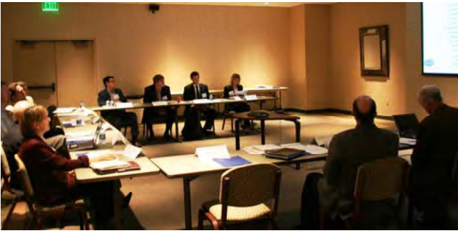
Chula Vista Research Project Workshop