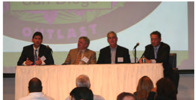
Eighth Annual Residential Real Estate Conference: Outlook 2008

and USD MBA students on where the market is headed in 2008 and beyond.